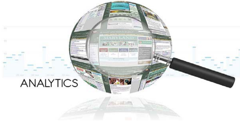
Site Traffic by Content Areas

39,695 google 31,934 direct (typed the URL directly) 13,410 jobaps.com 11,149 bing 8,866 google.com 4,854 search 4,467 yahoo 3,565 maryland.gov 2,749 intranet.dpssc.mdstate 2,673 mdcourts.gov