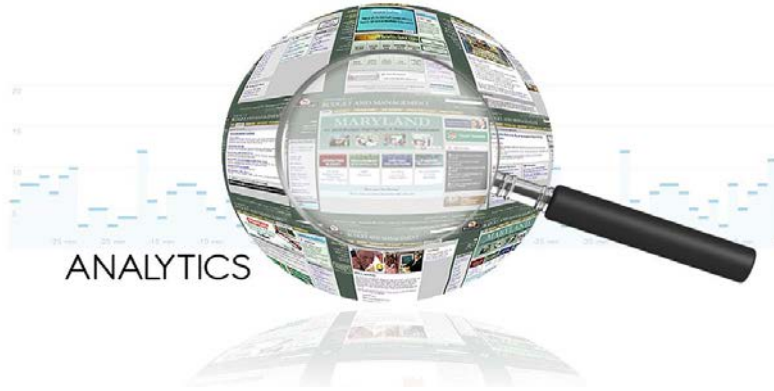
Site Traffic by Content Areas

31,760 google 26,491 direct (typed the URL directly) 14,248 jobaps.com 10,594 bing 8,754 google.com 4,364 search 4,232 yahoo 3,220 intranet.dpsc.mdstate 1,988 maryland.gov 1,972 mdcourts.gov