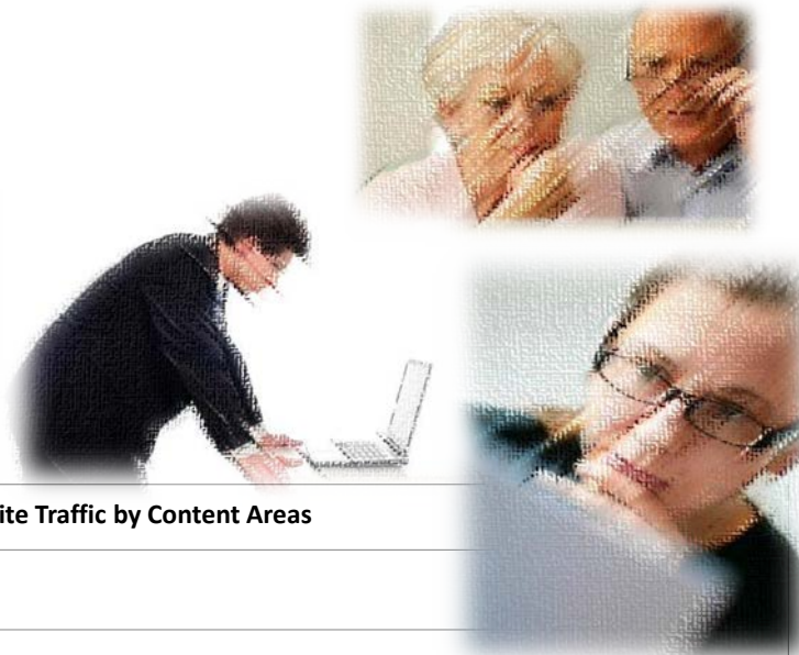
Site Traffic by Content Areas

43,281 google 23,797 direct (typed the URL directly) 8,905 jobaps.com 8,419 bing 4,381 search 3,988 maryland.gov 3,881 yahoo 3,111 intranet.dpsc.mdstate 1,558 mdcourts.gov 1,175 dpssc.state.md.us