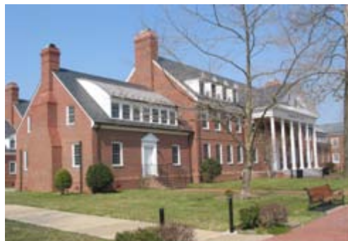
Somerset Hall Building – LEED Gold Cert.

The UMES – SunEdison Solar Production facility is completed and will be commissioned on March 28, 2011. This 2.2 megawatt photovoltaic’s facility located on a 17 acre farm on UMES’ campus is already producing green energy that is consumed by UMES. It is estimated that it will produce 3 million kilowatt hours annually and will account for about 10% of UMES annual electricity usage.