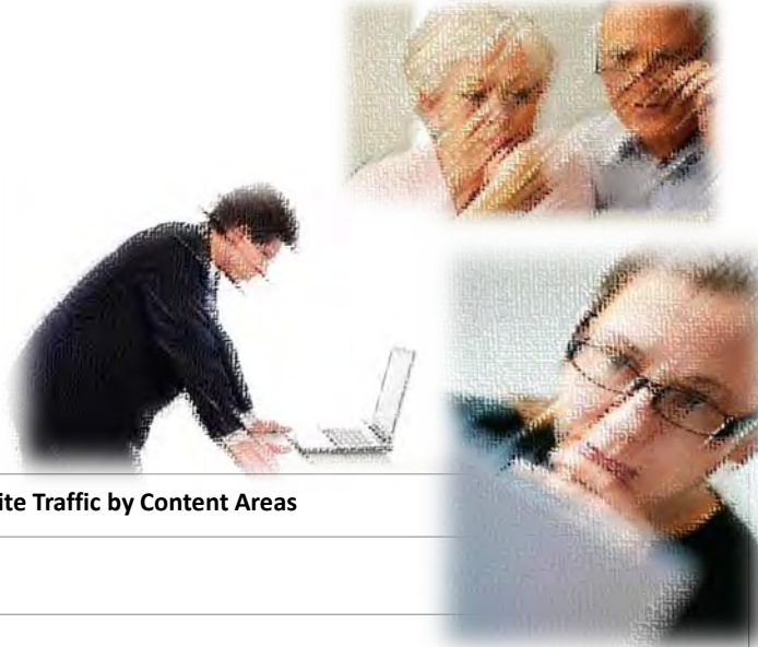
Site Traffic by Content Areas