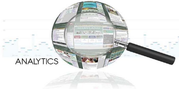
Site Traffic by Content Areas

51,430 google 35,386 direct (typed the URL directly) 13,052 jobaps.com 11,556 bing 6,310 google.com 6,047 search 5,876 maryland.gov 5,354 yahoo 3,301 intranet.dpssc.mdstate 1,789 mdcourts.gov