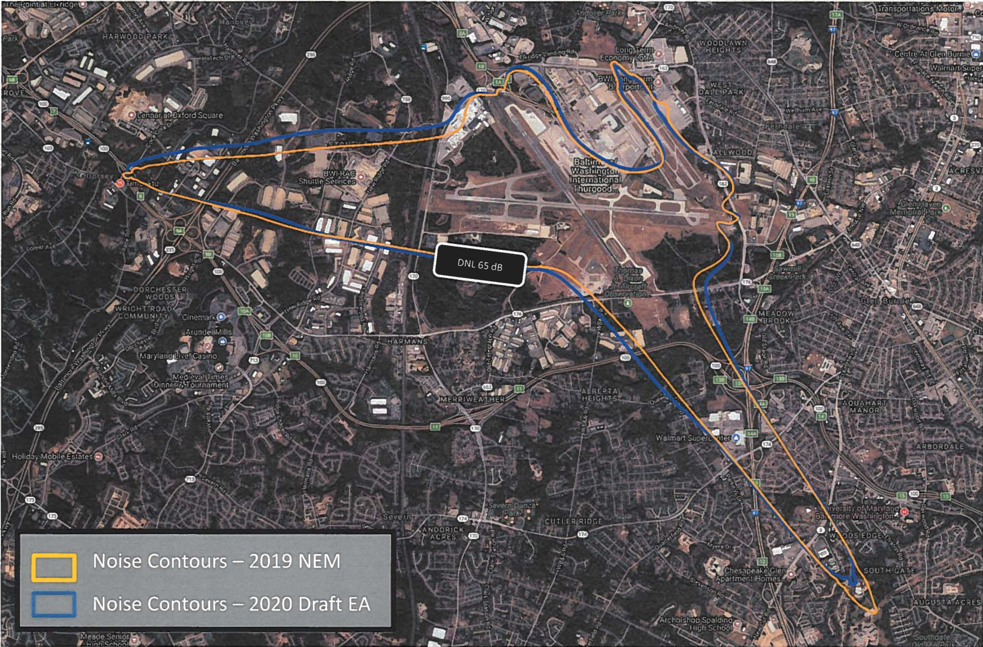
Figure 3. Comparison of forecast 2019 Noise Exposure Map (used for mitigation) and Draft EA 2020 Noise Exposure Contour (inclusive of current NextGen procedures)