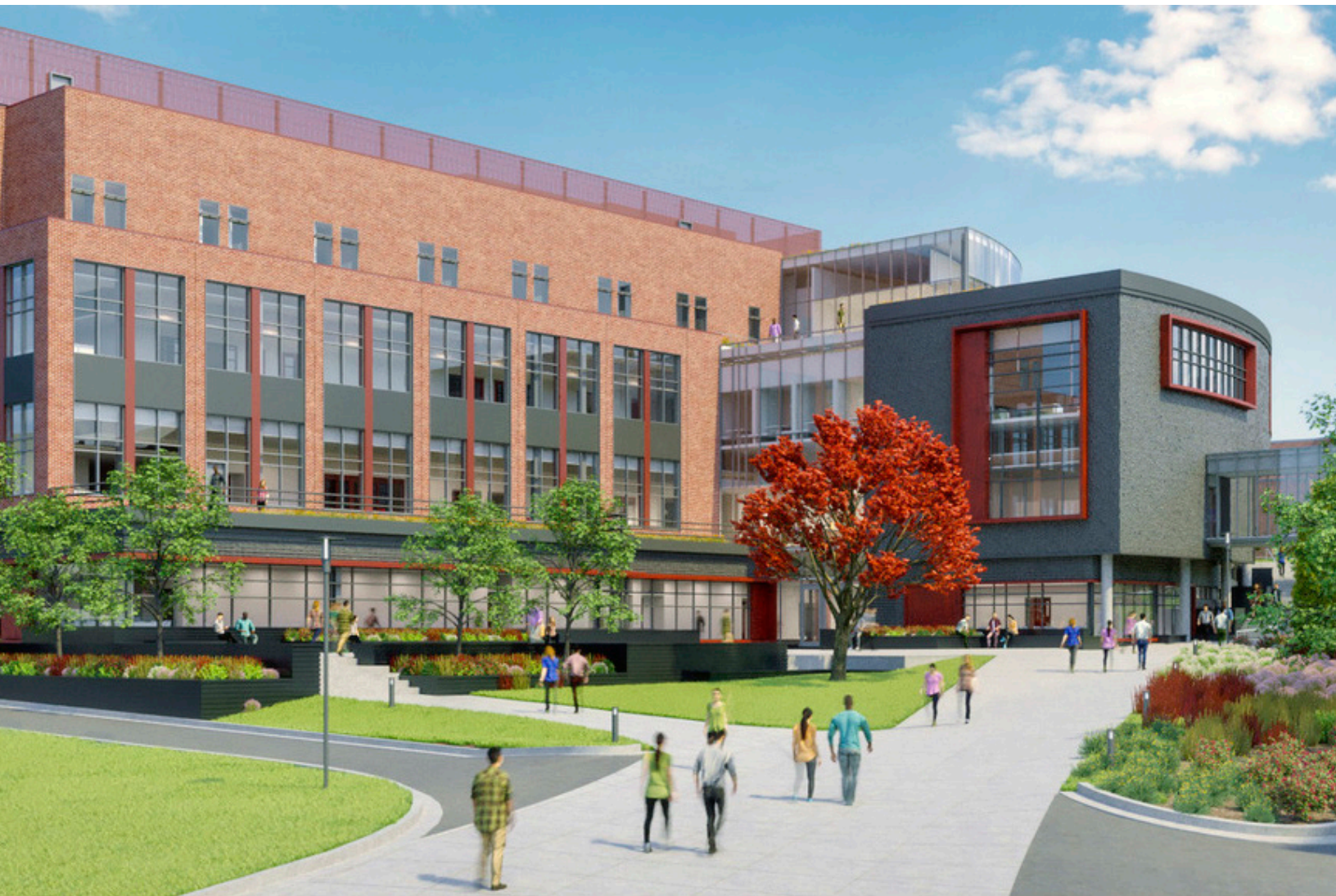
Design for Education & Health Sciences Center.