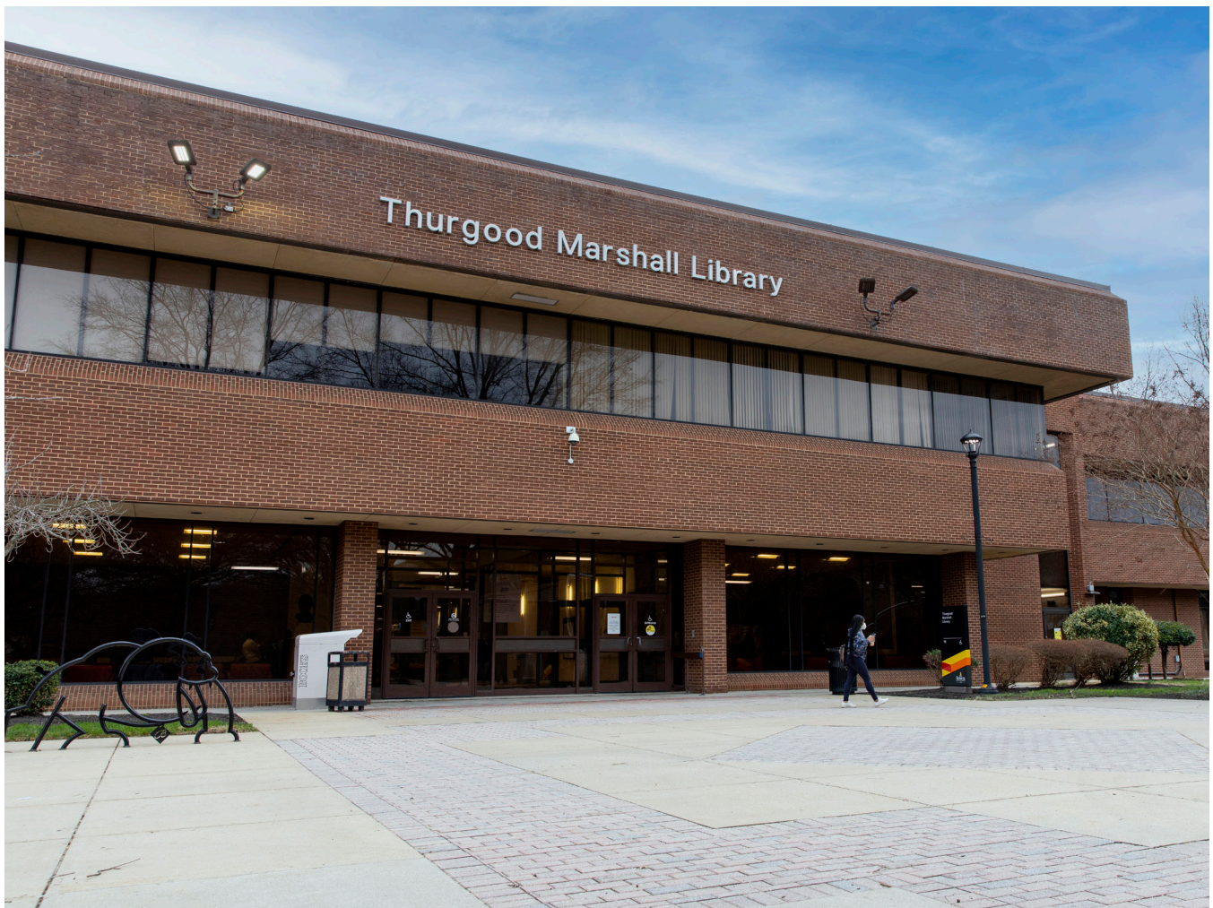
Thurgood Marshall Library

Not only do our faculty and students deserve 21st century, first-class academic facilities, but the workforce demands it, and our growth and competitiveness depend greatly upon it. I thank you for your support for funding for our new Martin Luther King, Jr. Communication Arts and Humanities building. We urge your consideration for funding to begin planning for our library renovation.