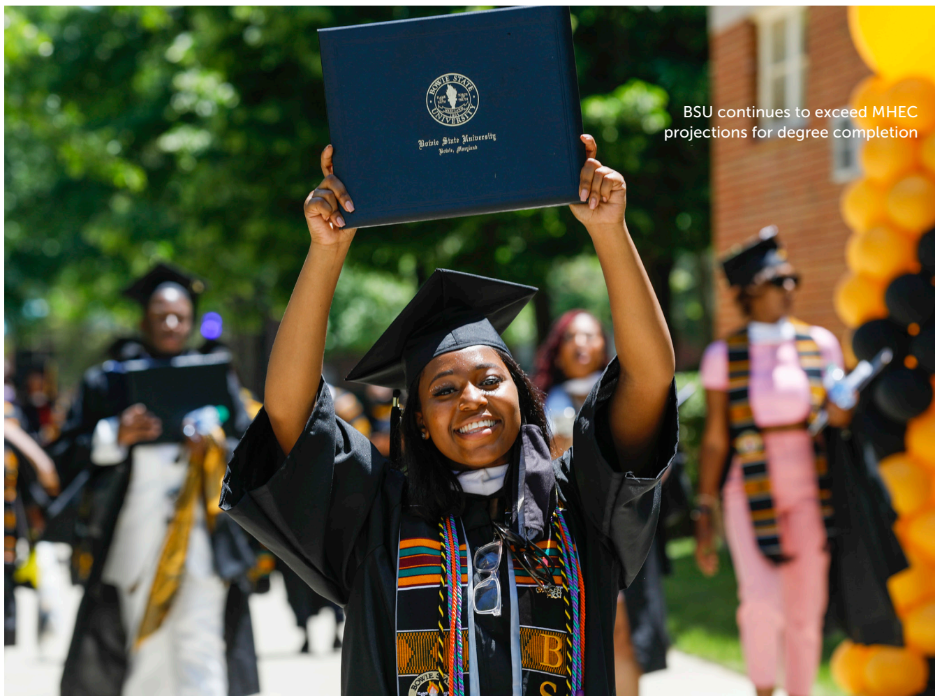
BSU continues to exceed MHEC projections for degree completion

We completed the update to our Facilities Master Plan to align it with the FY 19–FY 24 Racing to Excellence Strategic Plan . The plan (which may be viewed here ) lays the groundwork for continued growth and academic innovation and makes a strong case for major investment in new and renovated facilities. Moreover, with the implementation of SB1/HB1 signed by the Governor in 2021, an infusion of operating funds beginning in FY 2023 will support the development of several new, high demand academic programs to support Maryland's workforce. BSU's new "niche" programs will draw on our strengths in cybersecurity, computer technology, professional studies and education. It is imperative that our infrastructure keep pace with the growth in enrollment and academic program offerings.