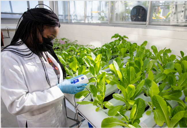
Student monitors readings in the hydroponics lab

Faculty in the College of Education continue the work of supporting and advancing the K-12 teaching