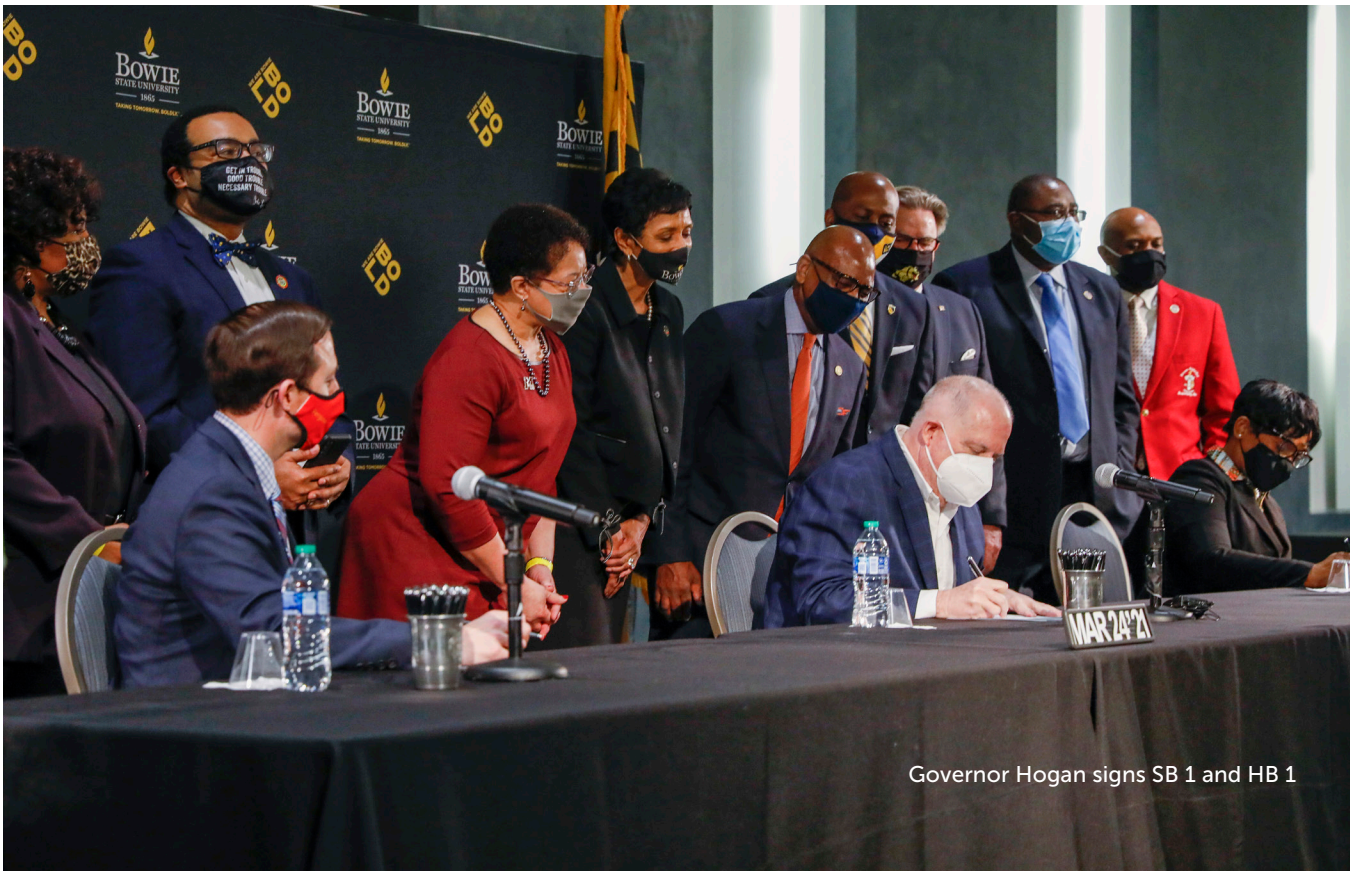
Governor Hogan signs SB 1 and HB 1

I urge this subcommittee to support the Governor’s FY 23 allowance for the University System of Maryland and Bowie State.