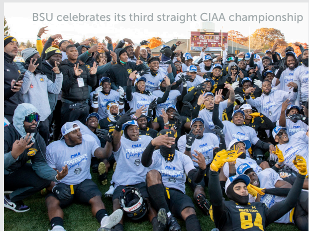
BSU celebrates its third straight CIAA championship