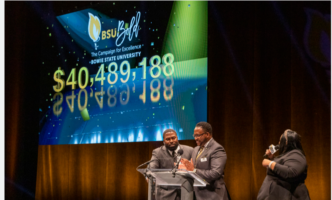
Announcement of latest tally for the BSU Bold campaign

Led by an energized advancement team, BSU surpassed our $3.5 million fundraising goal for last year. A $25 million donation from philanthropist MacKenzie Scott in 2020, the largest gift in the university's history, provided a major boost to the BSU endowment to help secure the long-term viability of the institution. It will also support investments in student financial support, advances in academic excellence and innovation. The Scott gift came at a critical time as we embarked on our largest-ever fundraising effort. Publicly-launched