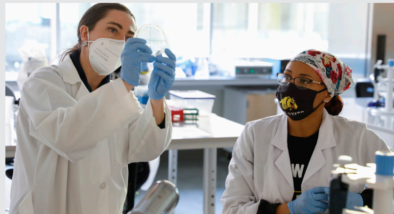
Student and professor in microbiology lab