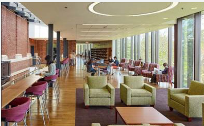
Proposed Academic Commons project