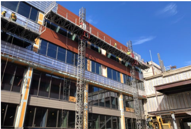
Above and right: Construction Progress

We thank the state for its support of the Sherman Hall renewal.